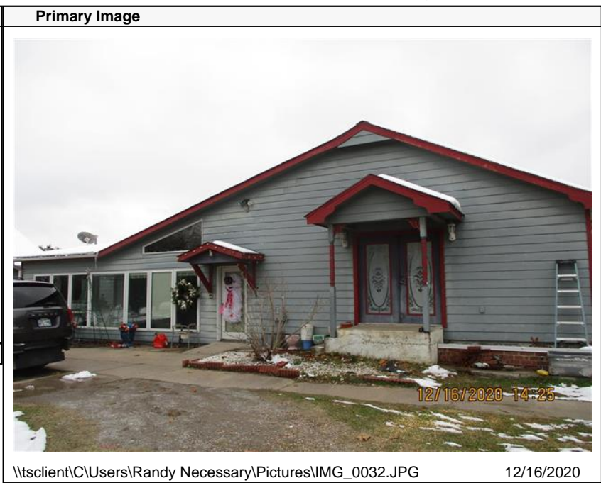
\\tsclient\C\Users\Randy Necessary\Pictures\IMG_0032.JPG 12/16/2020