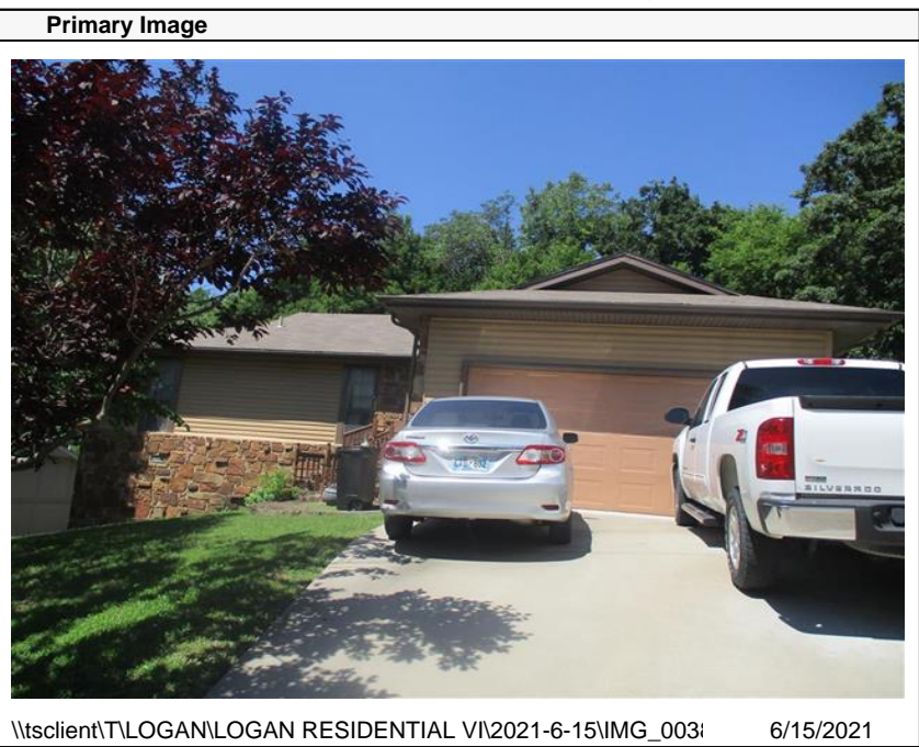
\\tsclient\T\LOGAN\LOGAN RESIDENTIAL VI\2021-6-15\IMG_003 6/15/2021