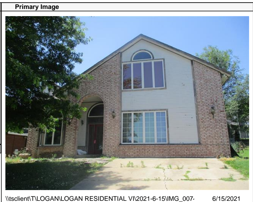
\\tsclient\T\LOGAN\LOGAN RESIDENTIAL VI\2021-6-15\IMG_007 6/15/2021