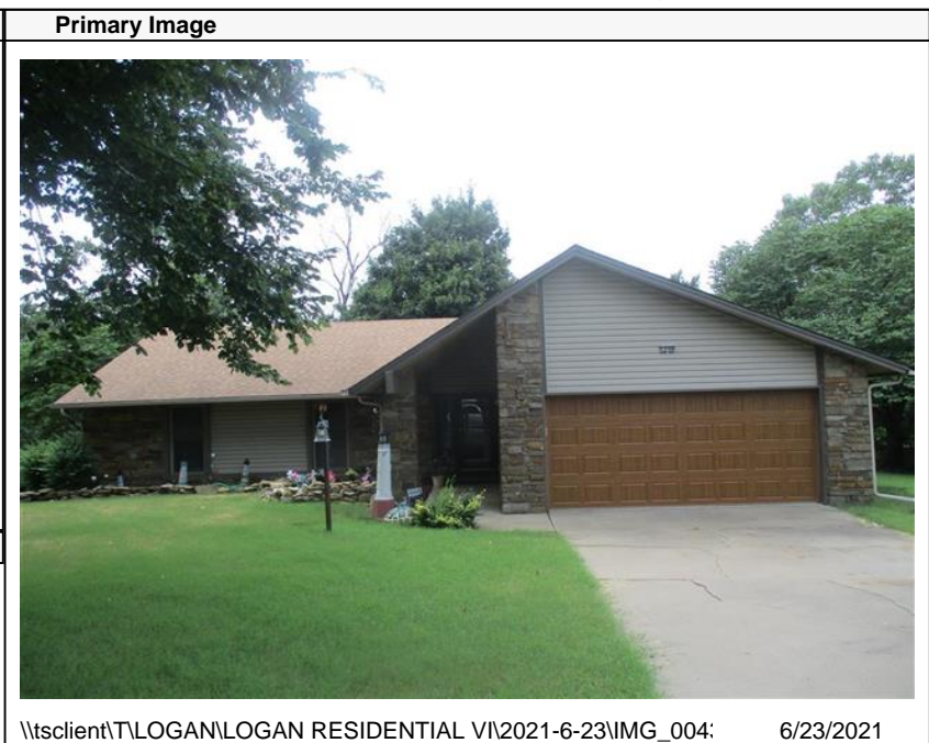
\\tsclient\T\LOGAN\LOGAN RESIDENTIAL VI\2021-6-23\IMG_004: 6/23/2021