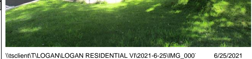
\\tsclient\T\LOGAN\LOGAN RESIDENTIAL VI\2021-6-25\IMG_000' 6/25/2021