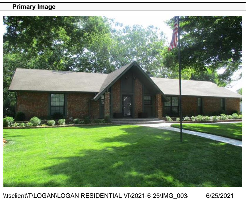
\\tsclient\T\LOGAN\LOGAN RESIDENTIAL VI\2021-6-25\IMG_003 6/25/2021