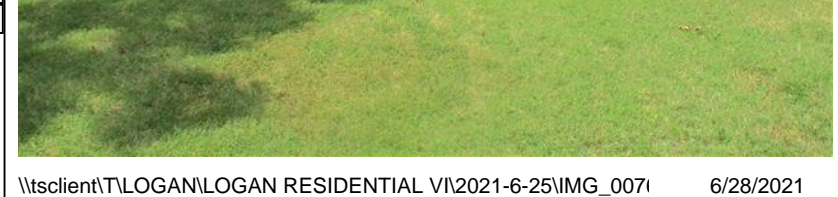
\\tsclient\T\LOGAN\LOGAN RESIDENTIAL VI\2021-6-25\IMG_007I 6/28/2021