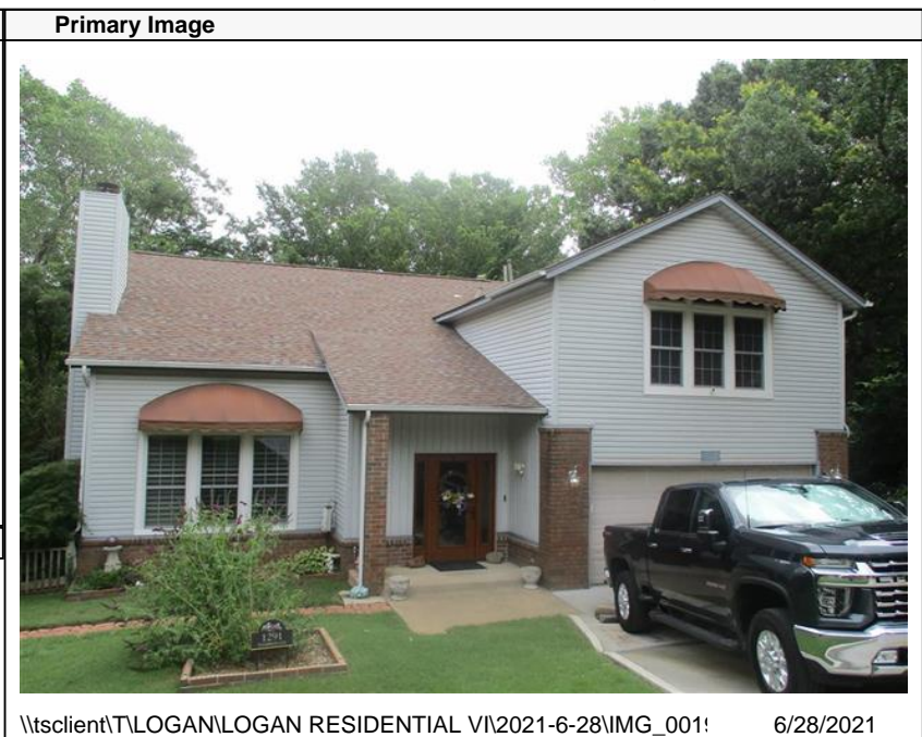
\\tsclient\T\LOGAN\LOGAN RESIDENTIAL VI\2021-6-28\IMG_001! 6/28/2021