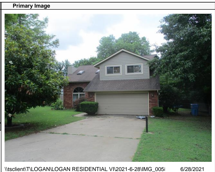
\\tsclient\T\LOGAN\LOGAN RESIDENTIAL VI\2021-6-28\IMG_005i 6/28/2021