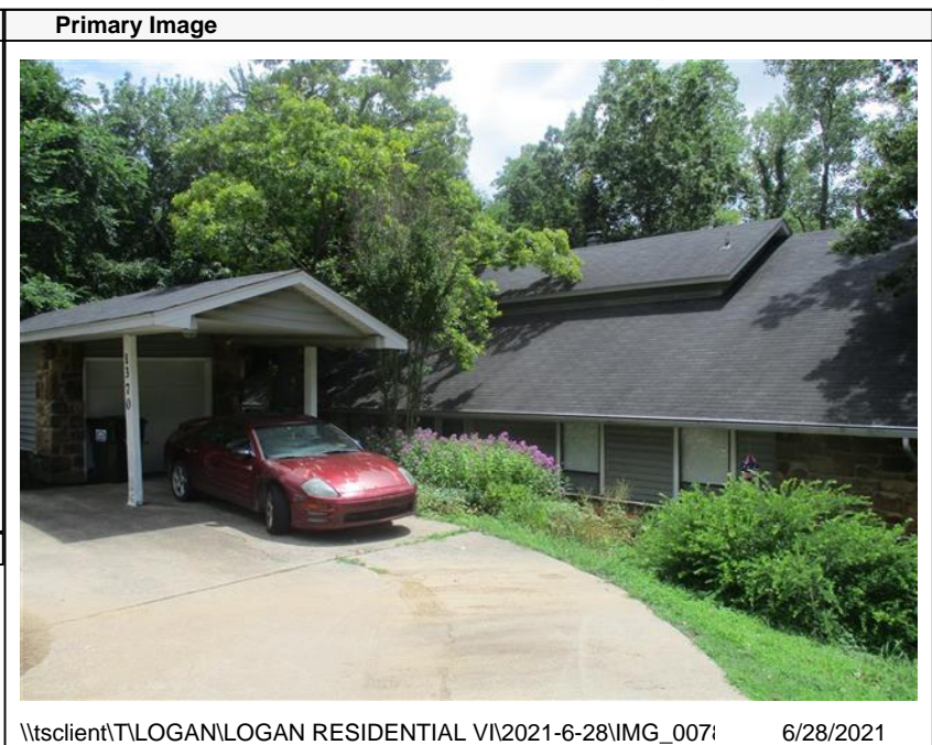
\\tsclient\T\LOGAN\LOGAN RESIDENTIAL VI\2021-6-28\IMG_0071 6/28/2021