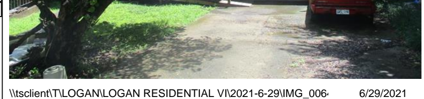
\\tsclient\T\LOGAN\LOGAN RESIDENTIAL VI\2021-6-29\IMG_006 6/29/2021