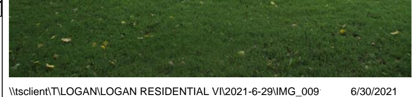
\\tsclient\T\LOGAN\LOGAN RESIDENTIAL VI\2021-6-29\IMG_009 6/30/2021