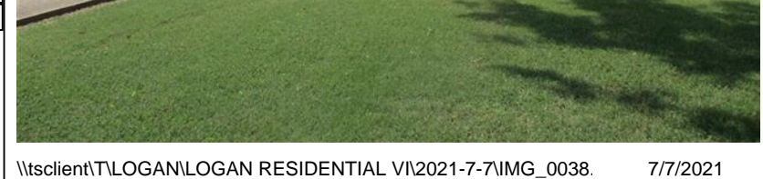
\\tsclient\T\LOGAN\LOGAN RESIDENTIAL VI\2021-7-7\IMG_0038. 7/7/2021