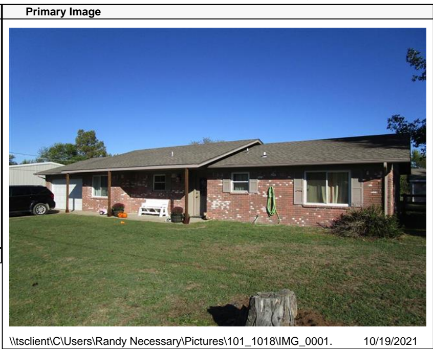
\\tsclient\C\Users\Randy Necessary\Pictures\101_1018\IMG_0001. 10/19/2021