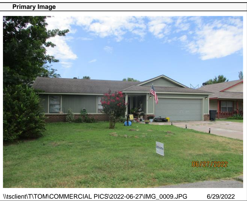
\\tsclient\T\TOM\COMMERCIAL PICS\2022-06-27\IMG_0009.JPG 6/29/2022