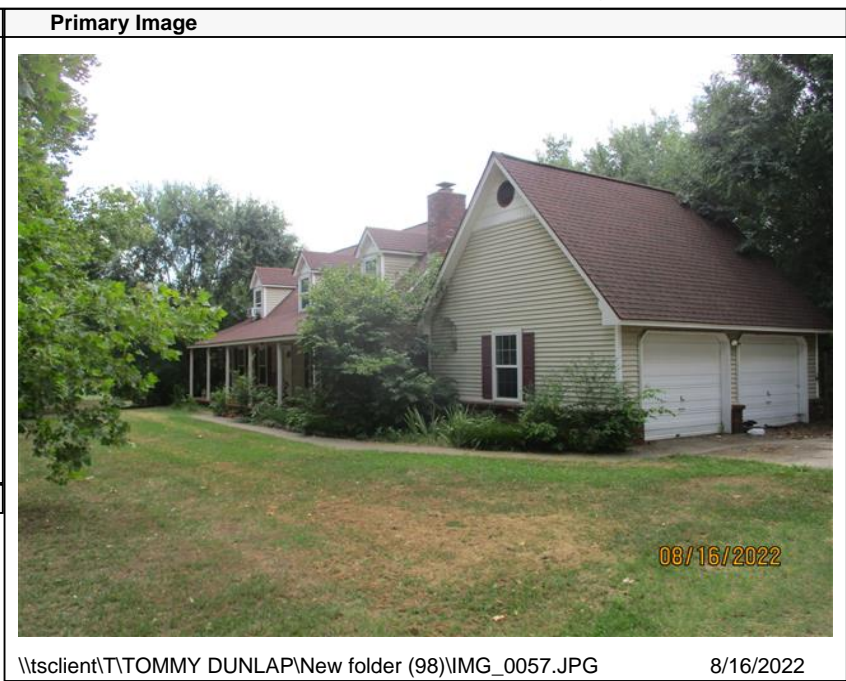
\\tsclient\T\TOMMY DUNLAP\New folder (98)\IMG_0057.JPG 8/16/2022