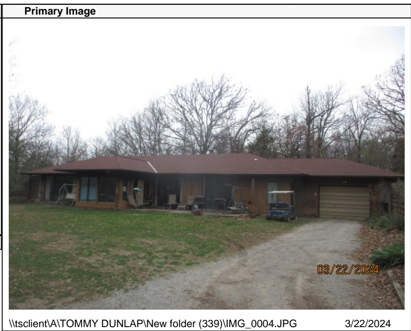
\\tsclient\A\TOMMY DUNLAP\New folder (339)\IMG_0004.JPG 3/22/2024