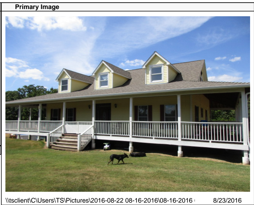
\\tsclient\C\Users\TS\Pictures\2016-08-22 08-16-2016\08-16-2016 8/23/2016