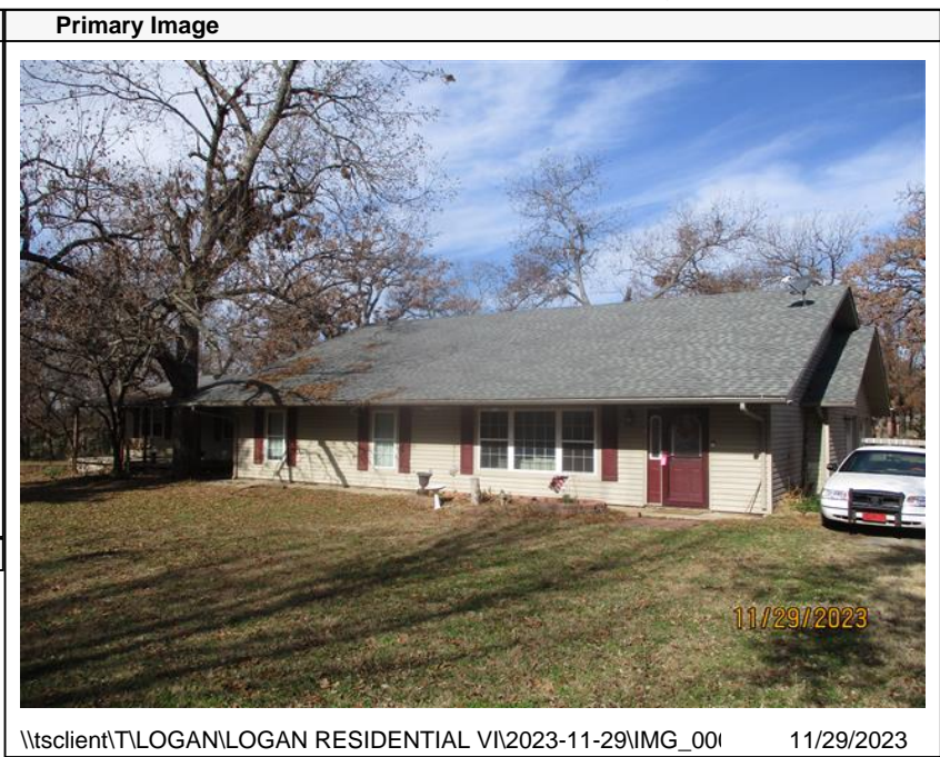
\\tsclient\T\LOGAN\LOGAN RESIDENTIAL VI\2023-11-29\IMG_001 11/29/2023