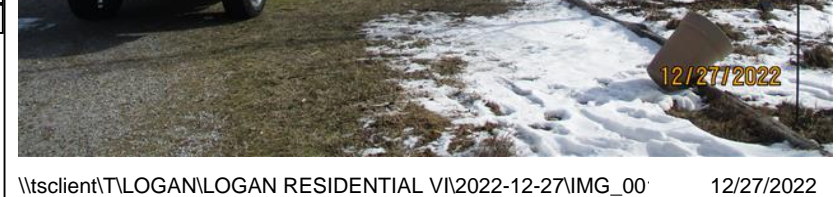
\\tsclient\T\LOGAN\LOGAN RESIDENTIAL VI\2022-12-27\IMG_00 12/27/2022