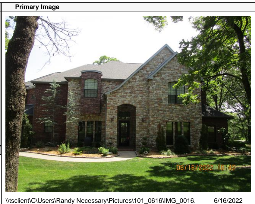
\\tsclient\C\Users\Randy Necessary\Pictures\101_0616\IMG_0016. 6/16/2022