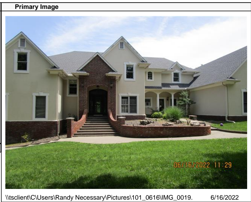
\\tsclient\C\Users\Randy Necessary\Pictures\101_0616\IMG_0019. 6/16/2022