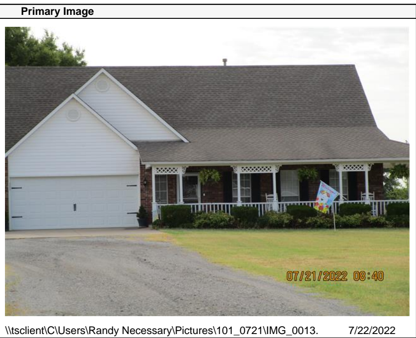
\\tsclient\C\Users\Randy Necessary\Pictures\101_0721\IMG_0013. 7/22/2022