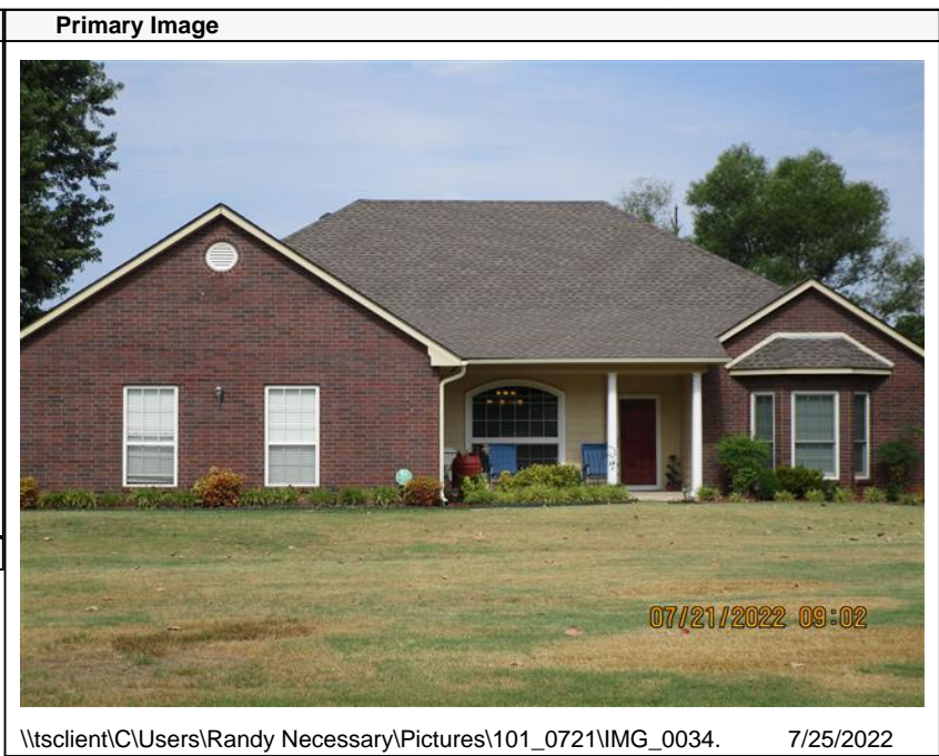
\\tsclient\C\Users\Randy Necessary\Pictures\101_0721\IMG_0034. 7/25/2022