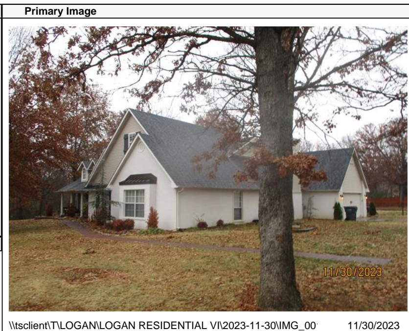
\\tsclient\T\LOGAN\LOGAN RESIDENTIAL VI\2023-11-30\IMG_00 11/30/2023