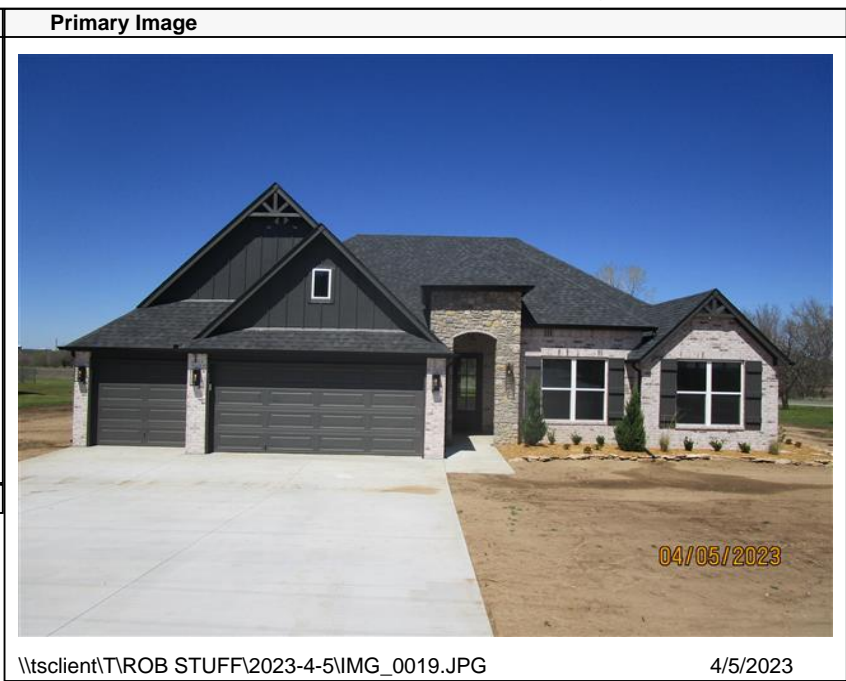
\\tsclient\T\ROB STUFF\2023-4-5\IMG_0019.JPG 4/5/2023