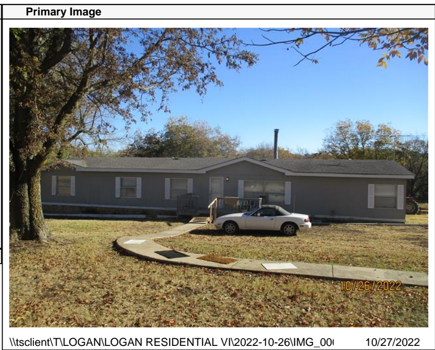
\\tsclient\T\LOGAN\LOGAN RESIDENTIAL VI\2022-10-26\IMG_001 10/27/2022