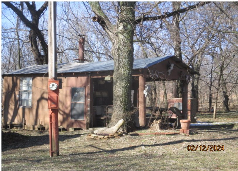
\\tsclient\A\TOMMY DUNLAP\New folder (331)\IMG_0032.JPG 2/12/2024

Lot Size Lot Count Units Buildable Non-Ag Acres 0 Topography Street Access Utilities Amenities LAND QUALITY Method Units-Buildable Base Lot Value Factor Value Adjustments Lot Value