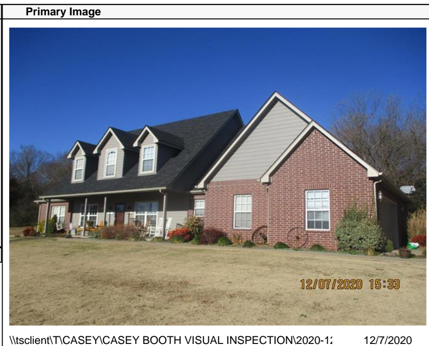
\\tsclient\TCASEY\CASEY BOOTH VISUAL INSPECTION\2020-1; 12/7/2020