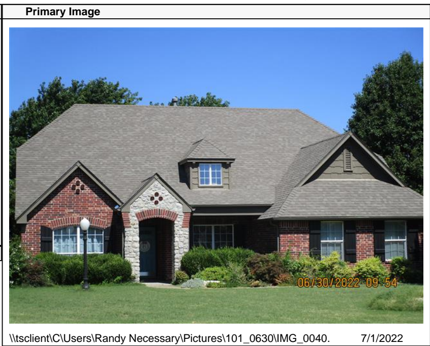
\\tsclient\C\Users\Randy Necessary\Pictures\101_0630\IMG_0040. 7/1/2022