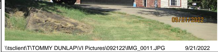
\\tsclient\T\TOMMY DUNLAP\VI Pictures\092122\IMG_0011.JPG 9/21/2022