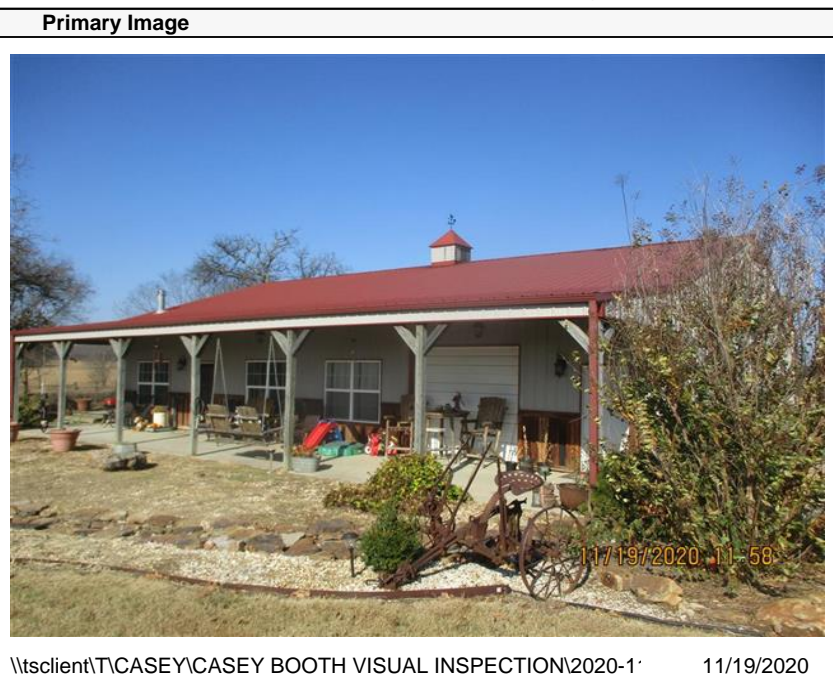
\\tsclient\TCASEY\CASEY BOOTH VISUAL INSPECTION\2020-1' 11/19/2020