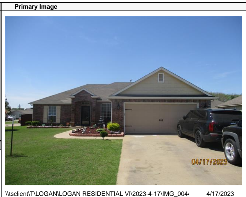
\\tsclient\T\LOGAN\LOGAN RESIDENTIAL VI\2023-4-17\IMG_004 4/17/2023