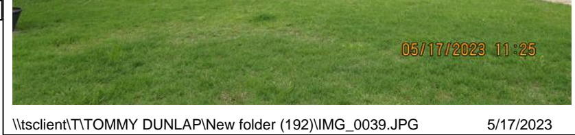
\\tsclient\T\TOMMY DUNLAP\New folder (192)\IMG_0039.JPG 5/17/2023