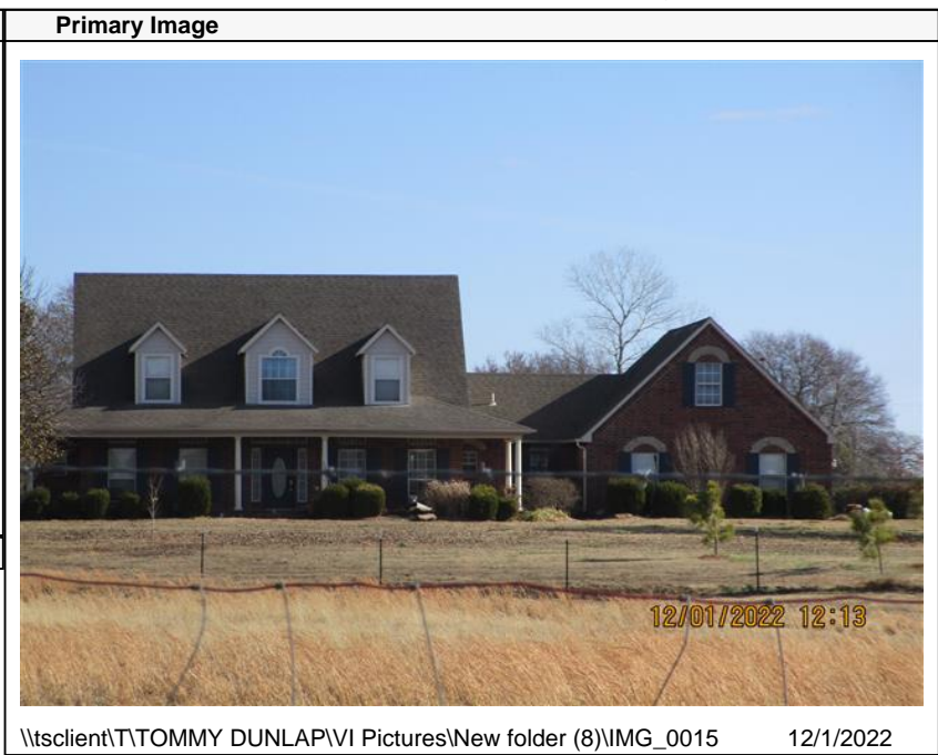
\\tsclient\T\TOMMY DUNLAP\VI Pictures\New folder (8)\IMG_0015 12/1/2022