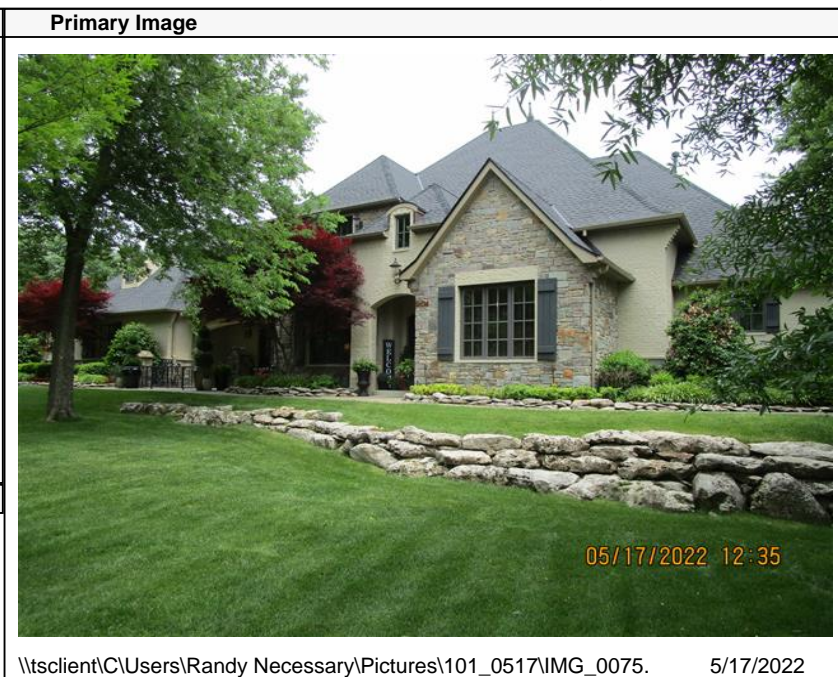
\\tsclient\C\Users\Randy Necessary\Pictures\101_0517\IMG_0075. 5/17/2022