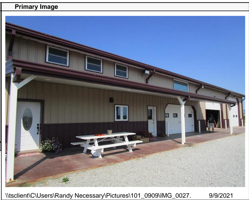
\\tsclient\C\Users\Randy Necessary\Pictures\101_0909\IMG_0027. 9/9/2021