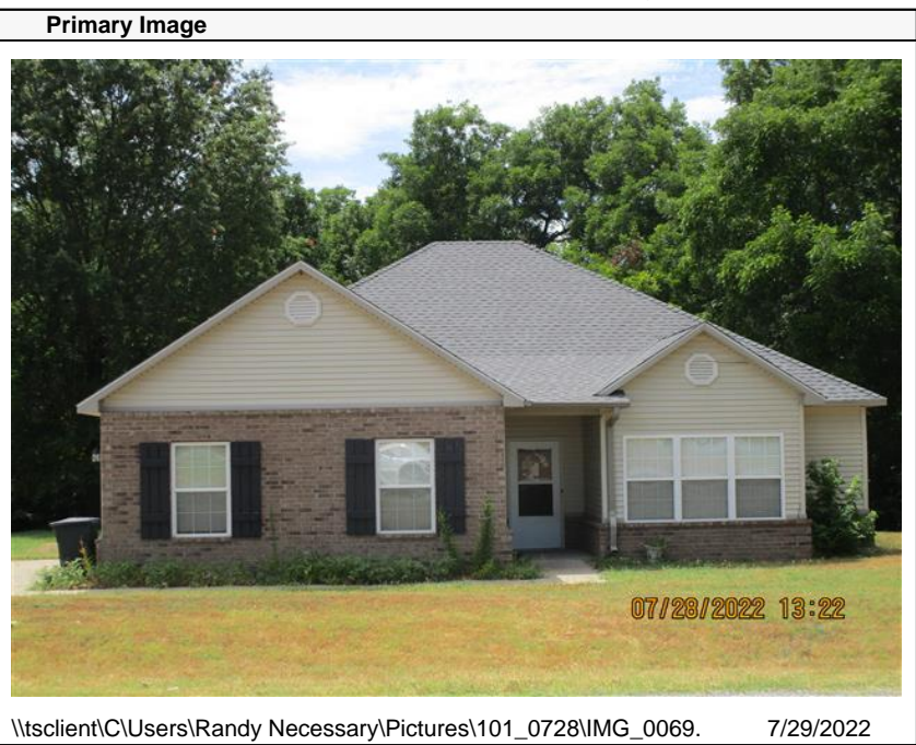
\\tsclient\C\Users\Randy Necessary\Pictures\101_0728\IMG_0069. 7/29/2022