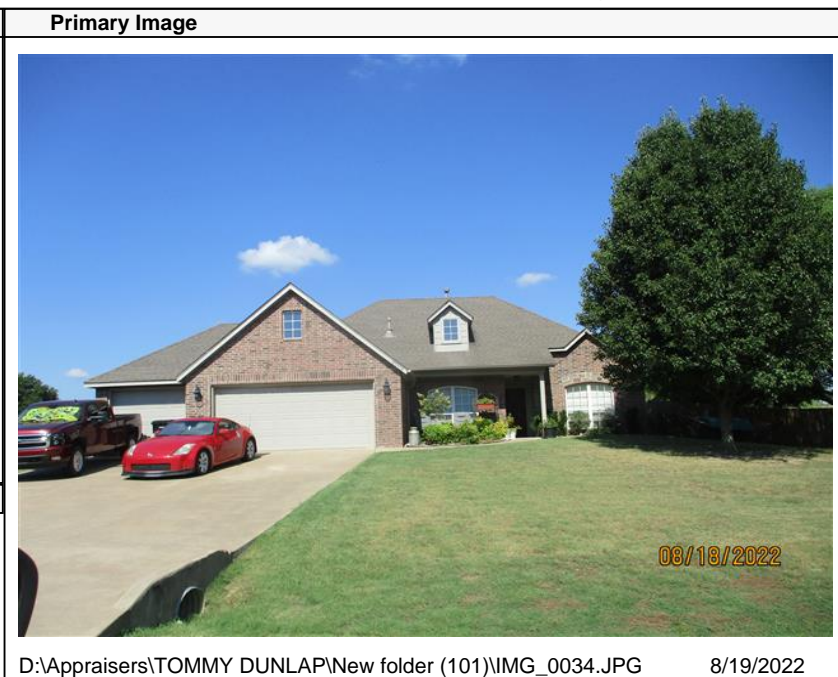
D:\Appraisers\TOMMY DUNLAP\New folder (101)\IMG_0034.JPG 8/19/2022