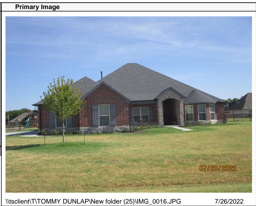
\\tsclient\T\TOMMY DUNLAP\New folder (25)\IMG_0016.JPG 7/26/2022