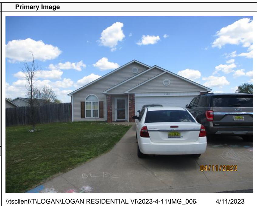
\\tsclient\T\LOGAN\LOGAN RESIDENTIAL VI\2023-4-11\IMG_006: 4/11/2023