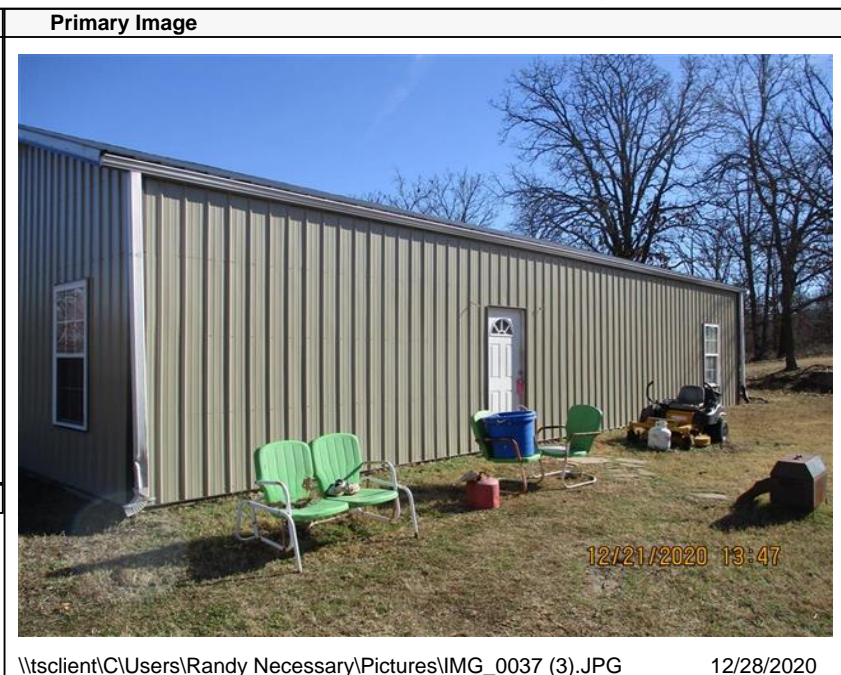
\\tsclient\C\Users\Randy Necessary\Pictures\IMG_0037 (3).JPG 12/28/2020