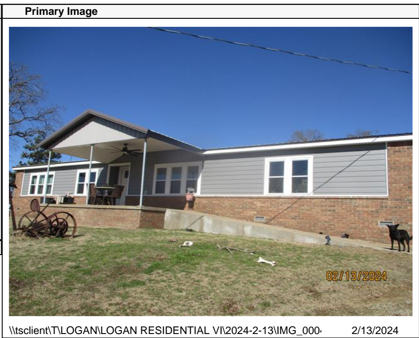
\\tsclient\T\LOGAN\LOGAN RESIDENTIAL VI\2024-2-13\IMG_000 2/13/2024