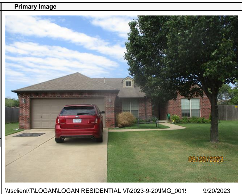
\\tsclient\T\LOGAN\LOGAN RESIDENTIAL VI\2023-9-20\IMG_001! 9/20/2023