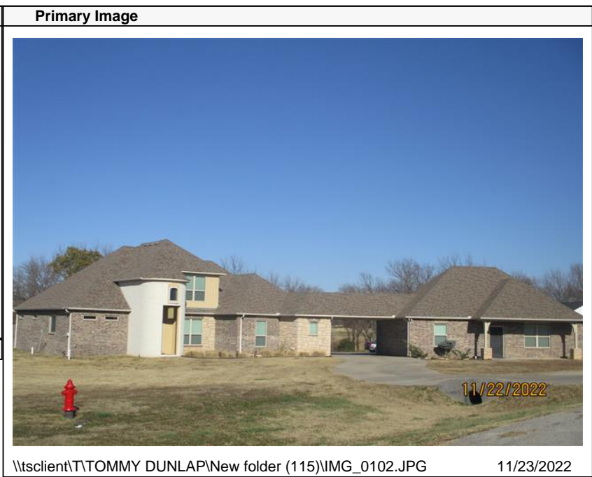
\\tsclient\T\TOMMY DUNLAP\New folder (115)\IMG_0102.JPG 11/23/2022