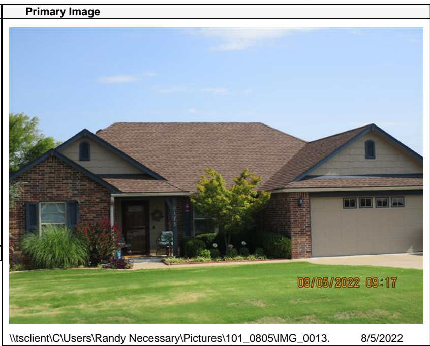
\\tsclient\C\Users\Randy Necessary\Pictures\101_0805\IMG_0013. 8/5/2022