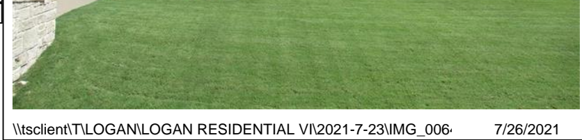
\\tsclient\T\LOGAN\LOGAN RESIDENTIAL VI\2021-7-23\IMG_006 7/26/2021