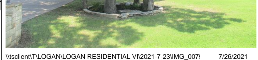
\\tsclient\T\LOGAN\LOGAN RESIDENTIAL VI\2021-7-23\IMG_007! 7/26/2021