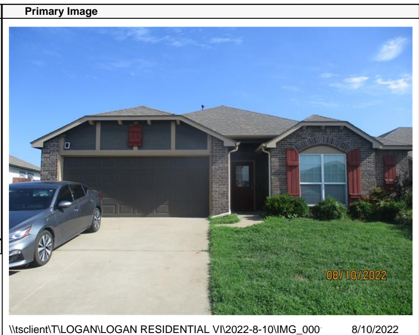
\\tsclient\T\LOGAN\LOGAN RESIDENTIAL VI\2022-8-10\IMG_000 8/10/2022