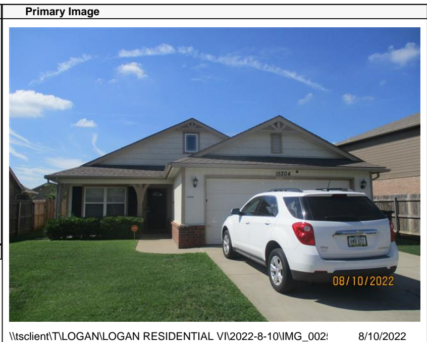
\\tsclient\T\LOGAN\LOGAN RESIDENTIAL VI\2022-8-10\IMG_002! 8/10/2022